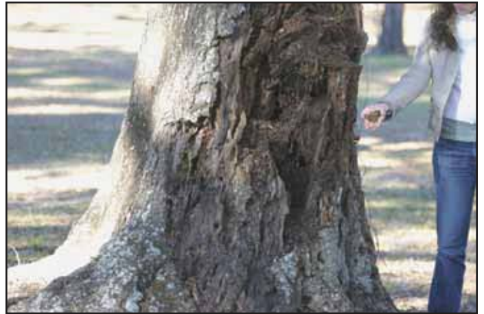
Figure 2. Visual evidence of decayed wood on the surface of affected stems is a positive indicator.

Conks and mushrooms of wood decay fungi are positive indicators that mean a tree has internal decay, even if other outward symptoms of decay are not present. The presence of one or more conks means the tree has decay in its heartwood and/or sapwood. Identifying the species of a fungal conk can sometimes provide additional information on the severity of internal decay. Conks or mushrooms are not in and of themselves evidence that tree removal is necessary, anymore than the presence of other positive indicators, such as a cavity or carpenter ants, suggest removal is always necessary. When positive indicators are present, more rigorous visual evaluation or other evaluation methods may be required to ascertain the severity of the decay and to help determine an appropriate management recommendation.