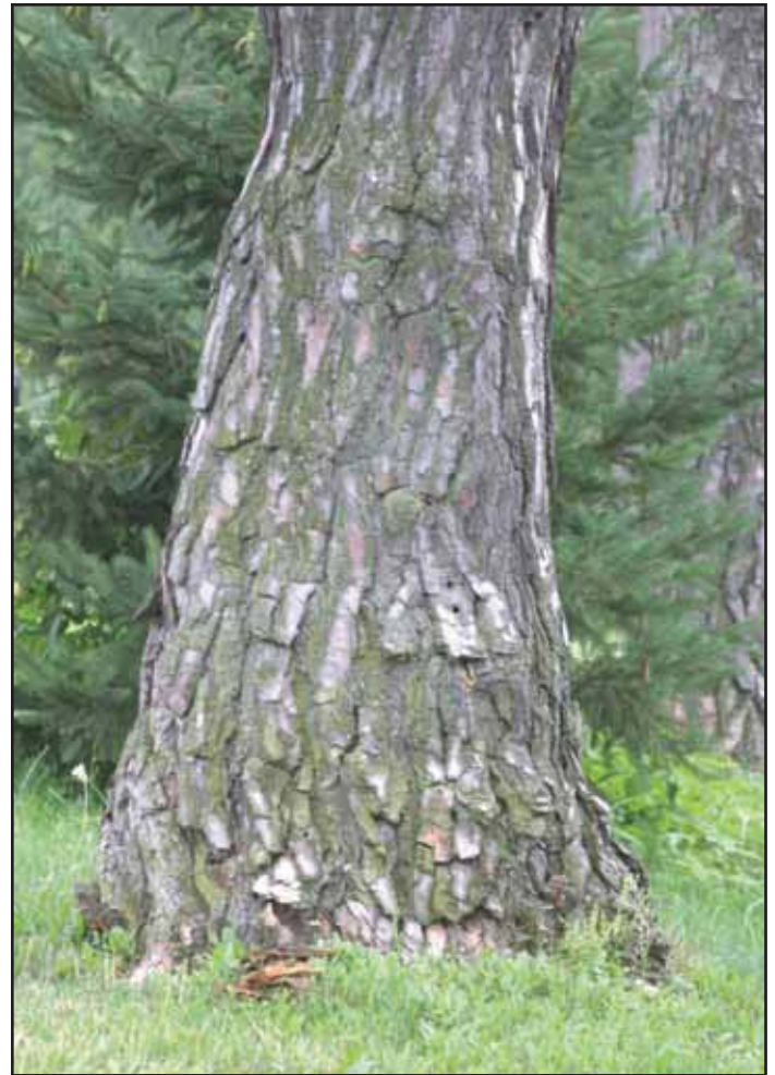
Figure 6. Bottle butt, or swelling at the base of the tree and loss of normal root flare, is a potential indicator of decay in the butt and buttress roots that is usually observed on older trees.

Severity of decay in roots, trunks, stems, and branches can be difficult to visually quantify using only decay indicators. In cases where decay has caused significant external cavities or where trees have partially failed, visual evaluation may be adequate to make an appropriate decision.