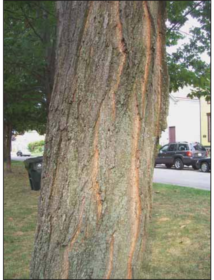
Figure 4. Exposure of inner bark may be a potential indicator of decay because it suggests response growth due to increased stress in a particular location.

in bulges or swelling in branches or the stem. Response growth is a mechanical and physiological process where a tree reacts to the loss of wood strength and movement at the cambium. Response growth may result in an increased quantity and quality (strength) of wood being produced by the cambium. Another decay indicator is the exposure of the inner bark from increased secondary response growth (Figure 4), similar to that which occurs on young trees that are increasing faster radially than the outer bark is expanding.