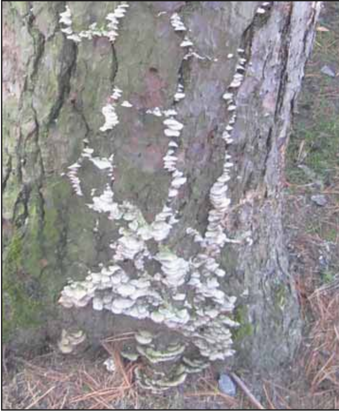
Figure 3. Sapwood rot fruiting structures are a positive indicator of decay. Sapwood decay typically develops when large areas of sapwood are exposed or large areas of bark and cambium are killed.