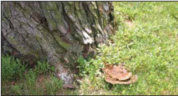
Figure 5. Some root and butt rot fungi may fruit on the ground from roots near the base of a tree. However, some mushrooms or fruiting on the soil near a tree may be from beneficial mycorrhizal or other non-pathogenic fungi.

Physical changes on the site that have wounded or damaged roots are another potential indicator of root decay. Evidence of fill or grading around trees, the lack of a normal basal root flare, or the wounding of exposed roots may suggest root loss or decay. Visually evaluating buttress and larger diameter roots is challenging, even if the tops of roots are exposed, because most root decay develops from the bottom of roots.