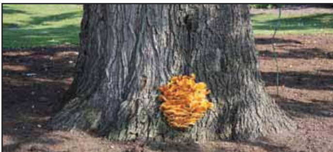
Figure 1. Conks or mushrooms are positive indicators of decay. Additional assessment is usually required to determine the severity of decay when conks are present.